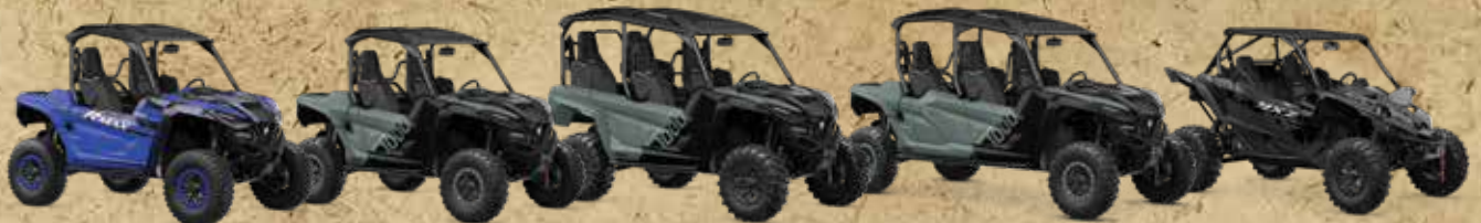
WOLVERINE RMAX2 1000 SPORT