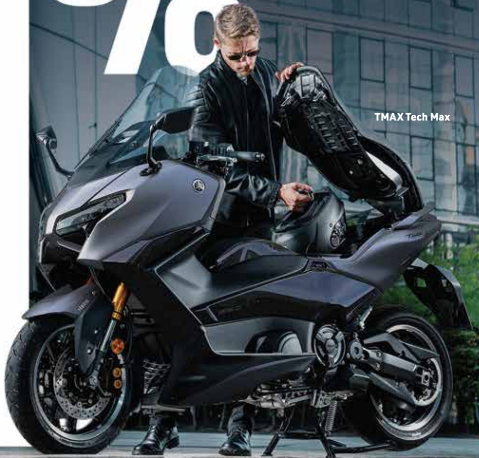
TMAX Tech Max

p.a. comparison rate finance* on selected MY26 and earlier scooters. 24 and 36 month terms.