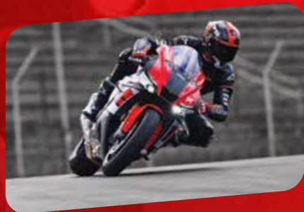
2026 - YOU