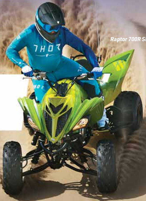
Raptor 700R SE

P.A. COMPARISON RATE FINANCE* ON MY25 SPORT ATVs 24 AND 36 MONTH TERMS