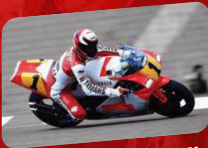
1991 - WAYNE RAINEY