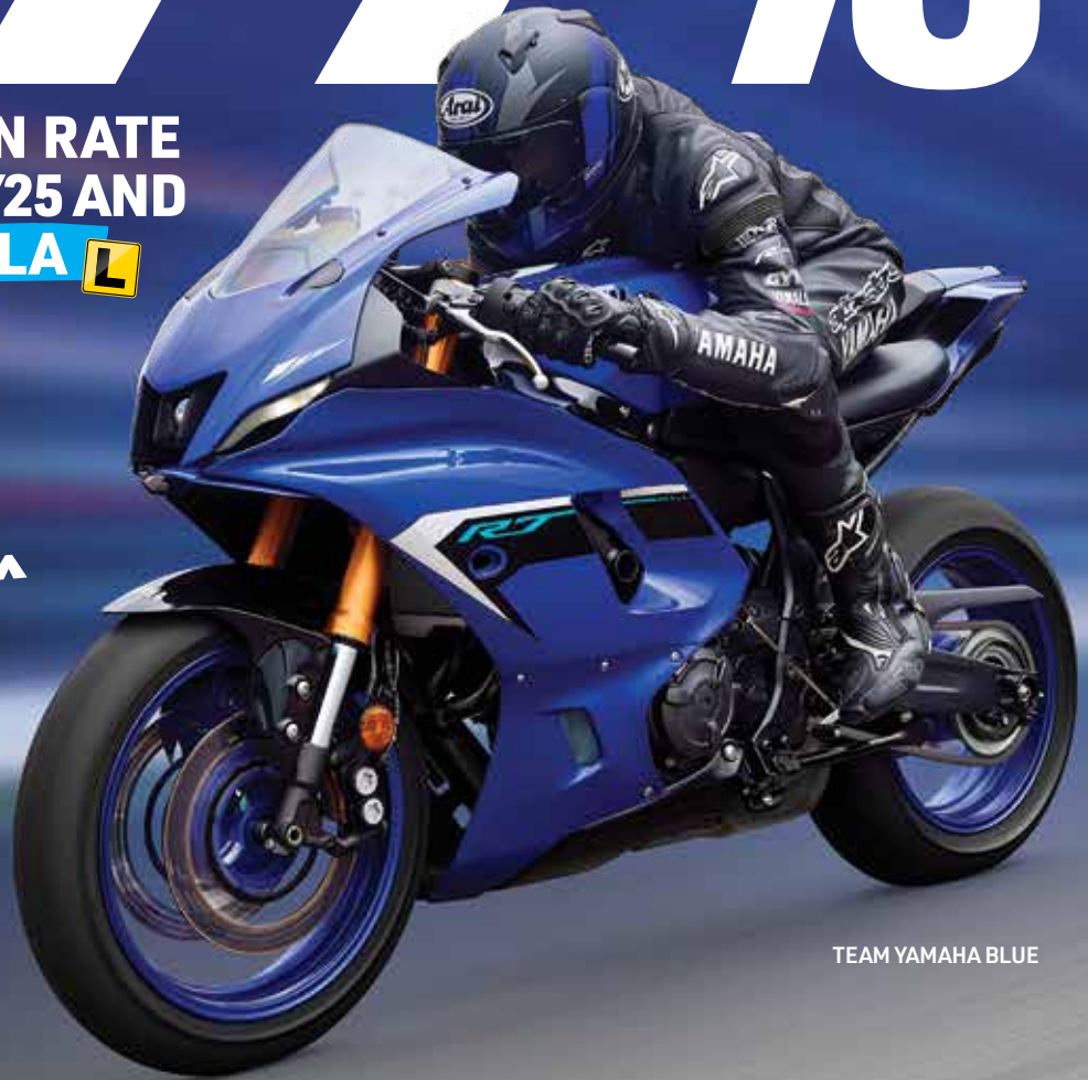
TEAM YAMAHA BLUE